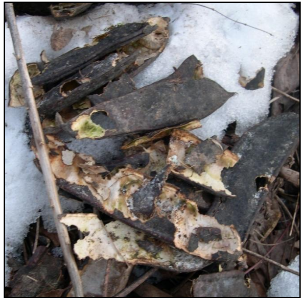
Chewing marks on pods – Lake of the Ozarks

Our next stop at Lake of the Ozarks found us searching along Swinging Bridges Road. This area was targeted due to historical herbarium specimen records. Unfortunately, only one tree was found. Further exploration resulted in finding multiple trees along the Grand Auglaize Creek Watershed. Of these, we sampled five, stretching across one mile. While sampling, numerous Kentucky coffeetree pods were noted with chewing marks from an animal with a nearby softball sized burrow. It was also interesting to note the turquoise – green colored water of Grand Auglaize Creek.